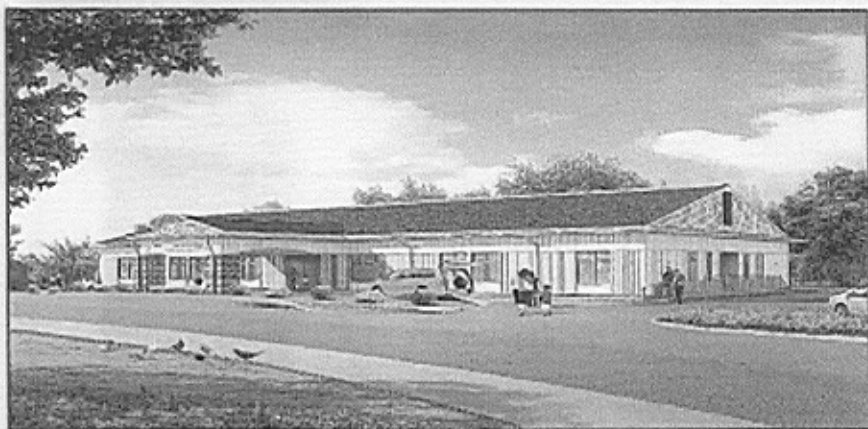
Architect's rendering of UCP's new Children's Center

The architect rendering of the new building was also unveiled at the event. Plans call for the current facility to be torn down, with the new structure being built in its footprint, but raised well above the water table. (continued on page 2)