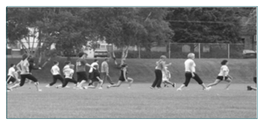
Participants go thru a routine at Fitstock for a Cause.

Check out a video from Fitstock! There's a link on our Facebook page.