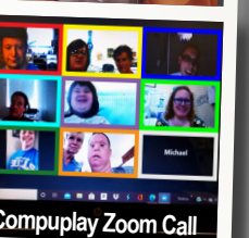
Compuplay Zoom Call